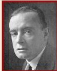
Though he was sickly, Saki had “an adventurer’s soul.”

There is such a thing as writing oneself out.